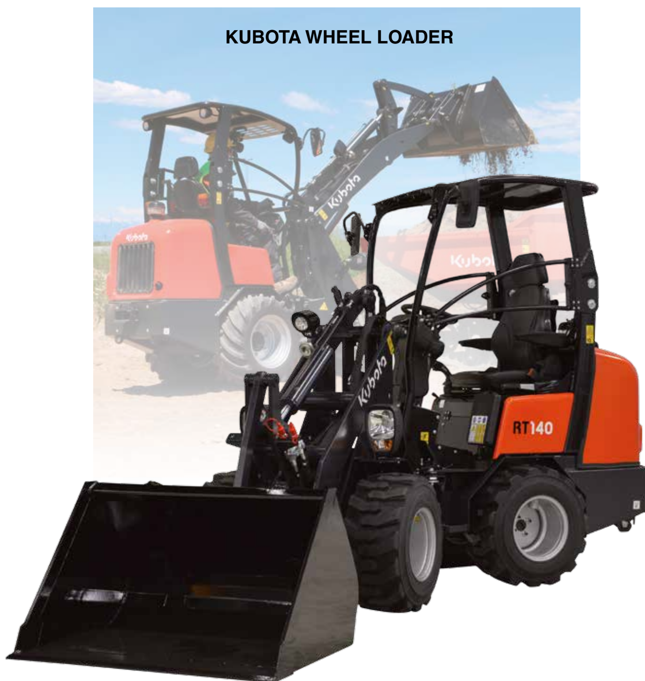
KUBOTA WHEEL LOADER