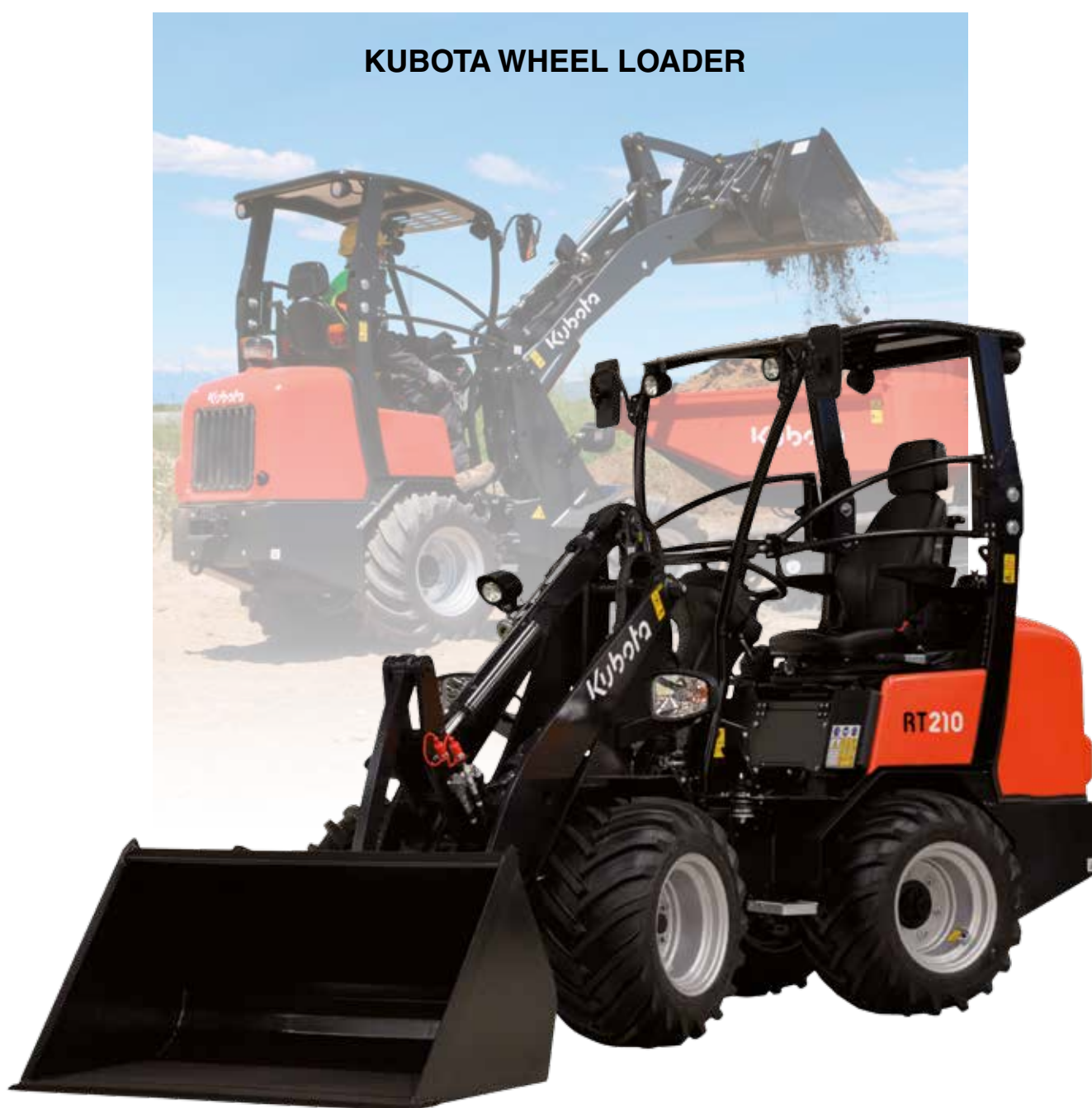
KUBOTA WHEEL LOADER