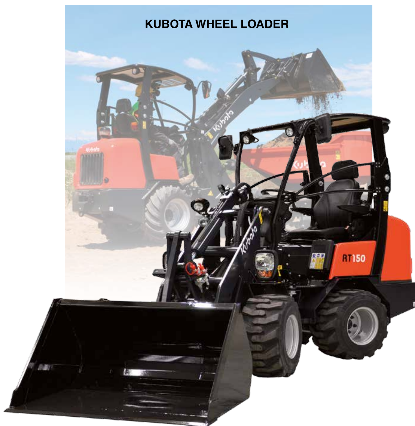
KUBOTA WHEEL LOADER