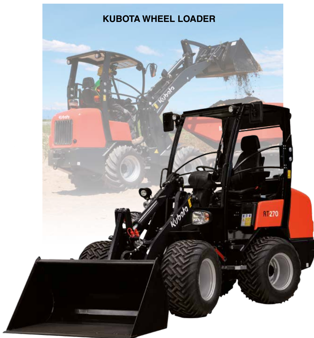
KUBOTA WHEEL LOADER