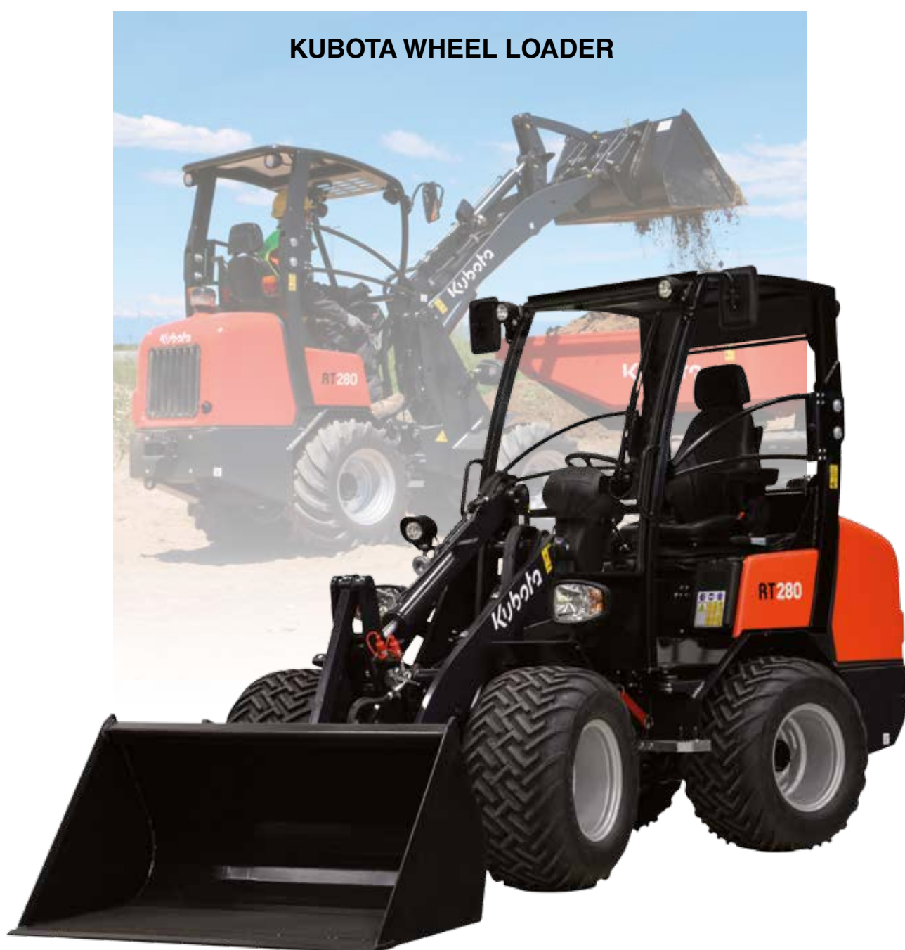
KUBOTA WHEEL LOADER